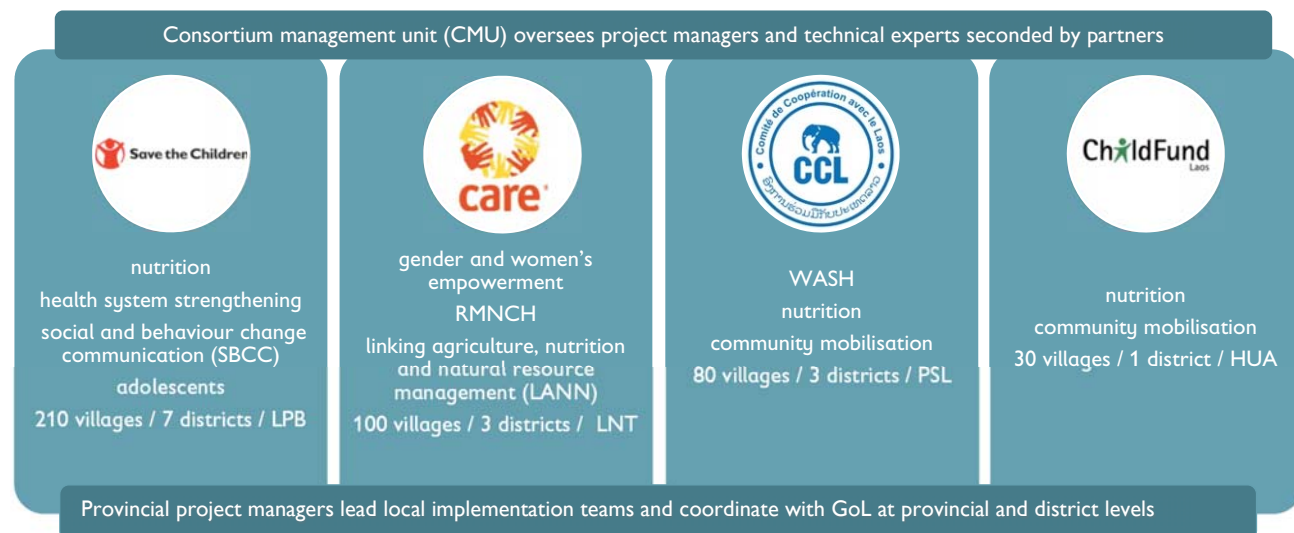
Figure: Partners' technical expertise and operational platform in SCALING

The project builds on partners' on-going work in Lao PDR and will be implemented through a phased approach, starting with villages where the partners are already operational and adding new cohorts of villages over 2019 and 2020. By 2021, GoL will be fully responsible for sustaining the project activities with the SCALING team providing continued mentoring and technical support, while also documenting and sharing project experiences, outcomes achieved, and lessons learned.